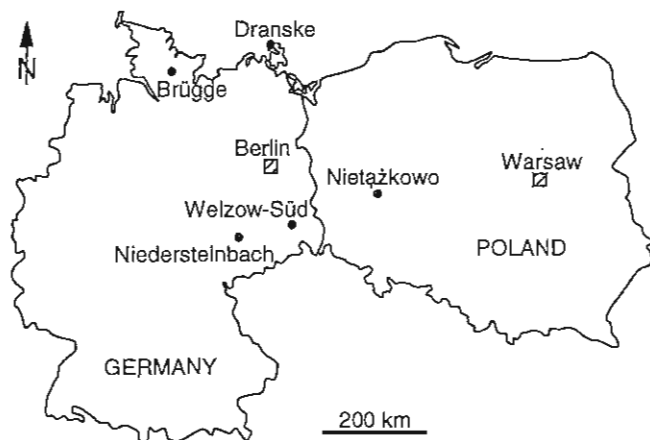
Fig. 2. Location of sites discussed in the text (dots)

ching for many tens of kilometres and reaching over 500 m depth in places (J. Ehlers et al. , 1984). N-channels occur as isolated features or they can create a network of arborescent or non-arborescent drainage systems. Such drainage systems develop from former distributed flow networks whose capacity was exceeded by meltwater surplus which could not have been accommodated by other, more static drainage modes anymore. As opposed to R-channels, the N-channels are not affected by glacier movement directly and can develop through down-cutting at one place even under highly mobile ice sheets. Discharge rates in N-channels can be occasionally extremely high, as indicated by reconstruction of some Pleistocene tunnel valleys where meltwater fluxes could have been in the range of few thousands m^3/s during short-lasting outburst phases (e.g. J. A. Piotrowski, 1994).