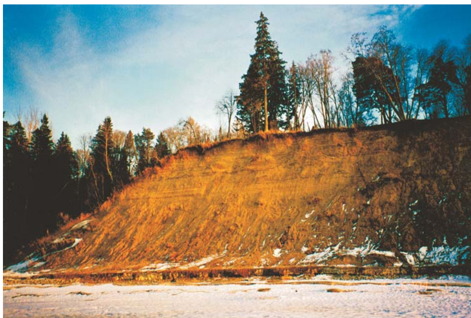
Fig. 3. In the Baltic Klint Bay at Voka the Quaternary cover is about 30 m thick The sampled upper 10 m of the section is represented by fine sand and silt

filled mainly with subaqueous deposits of the last glaciation; valleys filled mainly with glaciolacustrine deposits of the last glaciation; valleys with one till horizon with underlying or covering subaqueous deposits; valleys of complex structure with more than one till horizon and accompanying subaqueous deposits. We took samples only from the first type of valleys, filled mainly with subaqueous deposits of the last glaciation at Voka (Fig. 3), Pannjärve and Tääksi (Fig. 1).