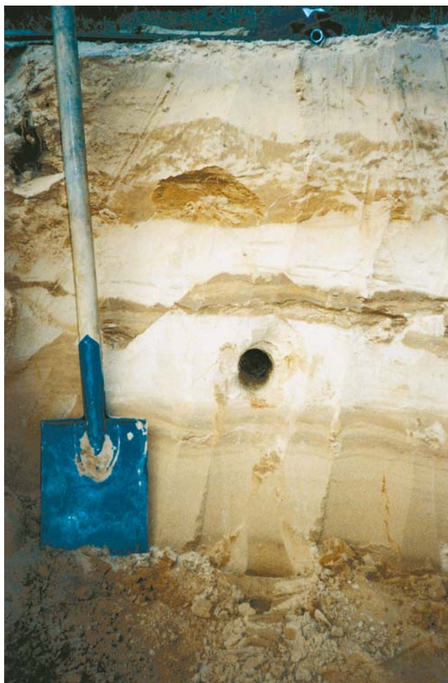
Fig. 2. Samples as a rule were taken from homogenous beds or interlayers, Nohipalu