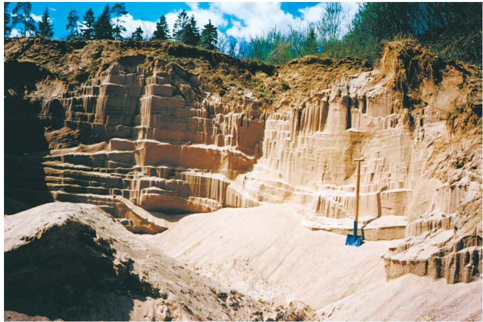
Fig. 4. Sand-grade beds were mostly sampled, Laiuse

We consider that inadequate light exposure in the glaciofluvial environment has commonly led to the OSL signal producing age overestimations.